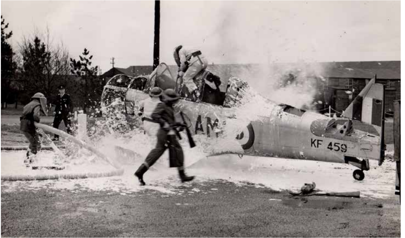
1954 Cranwell crew on the fire competition