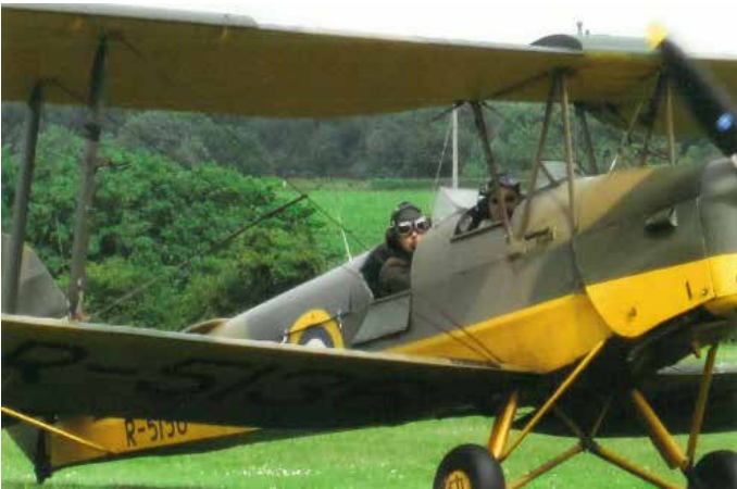
Tiger Moth Flight at 80