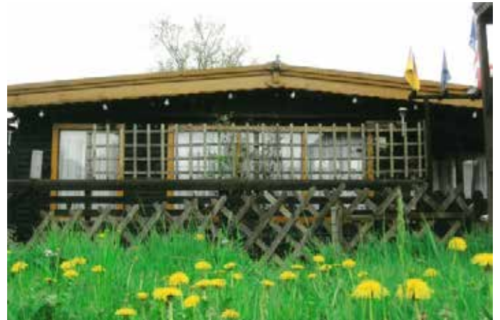
Dennis's much loved Cabin in Germany.