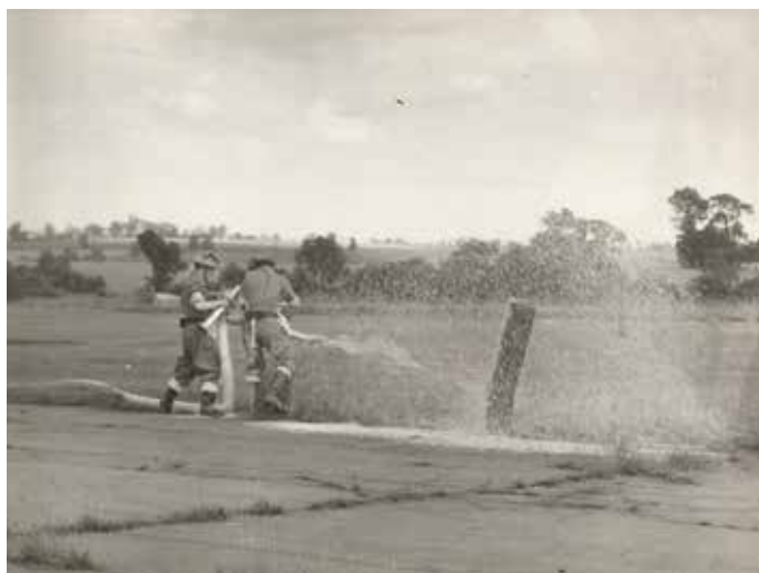
The two images above are during target practise and nozzle changing