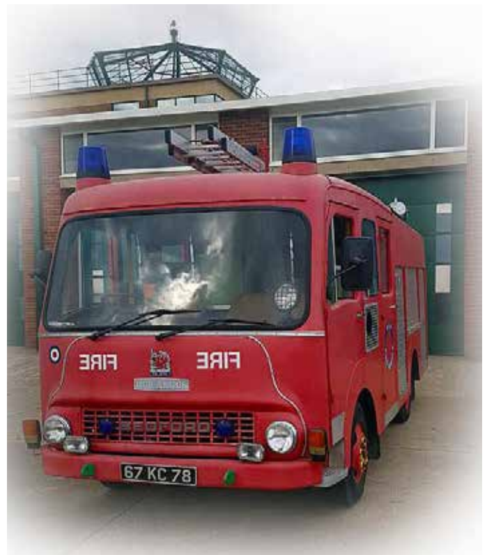
HCB Angus Domestic in front of refurbished Crash Bays