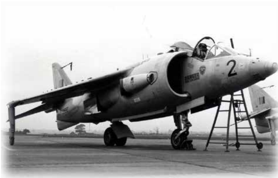
Kestrels on the flight line at West Raynham

flight operating procedures, perform instrument flight assessments, conduct night flight operations, and explore jet-borne manoeuvring throughout the Kestrel's flight envelope. The trials proved a great success leading to the introduction of the Harrier into RAF service later that decade. One of the most innovative designs in aviation history.