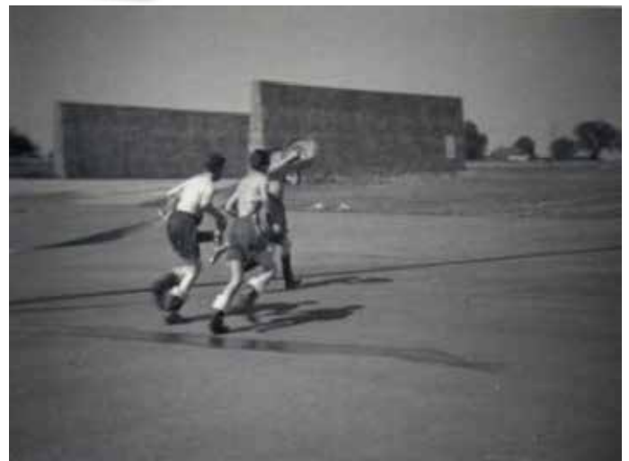
Some practise before the completion at Wattisham