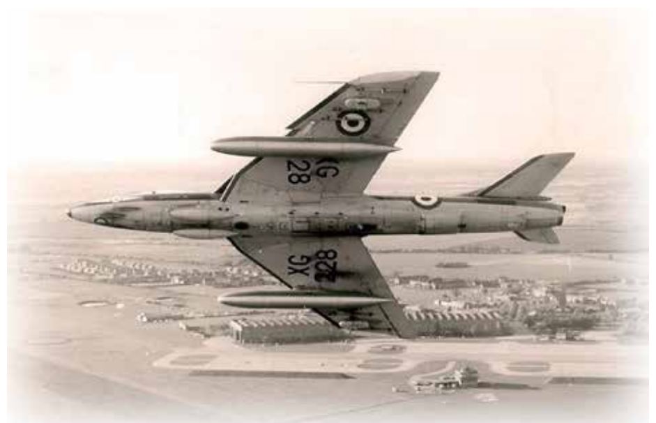
Hunter over West Raynham – note old crash bays facing the main runway

On 15 October 1964, the Tri-partite Evaluation Squadron (TES) was formed at RAF West Raynham, staffed by a diverse mix of military test pilots from Britain, the United States and West Germany. The personnel comprising the squadron were highly experienced pilots; prior to flying the Kestrel, each received a week's ground training at Bristol's in-house facility and a week's ground instruction at Dunsfold prior to a three-hour flight conversion instructed by Bill Bedford. The purpose of the squadron was to evaluate the suitability of V/STOL aircraft for field operations, compare competing styles and methods of taking off/landing, develop normal