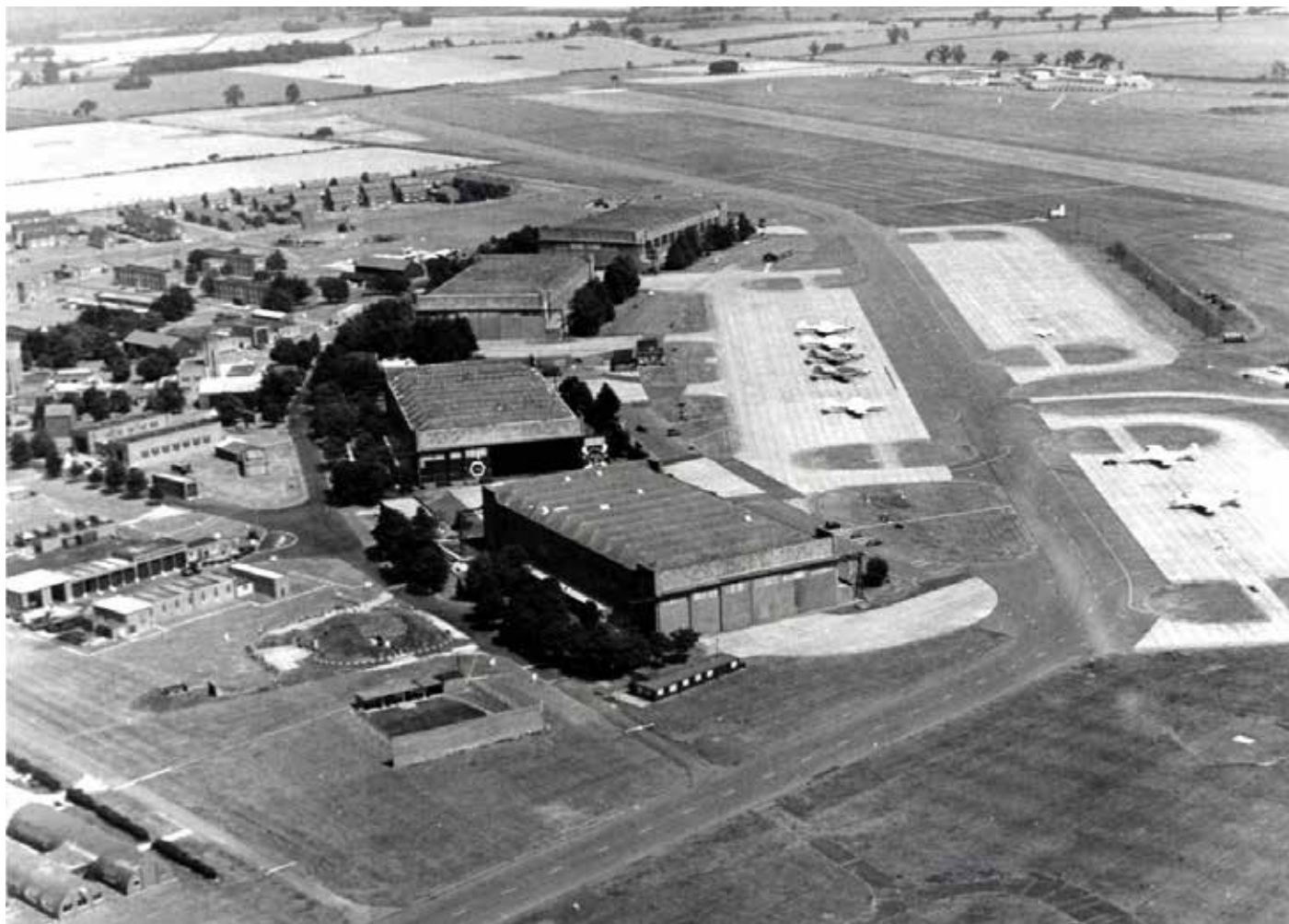
Aerial shot of camp during 100 & 85 Sqn Canberra days. Note BHSU at the far side of the runway