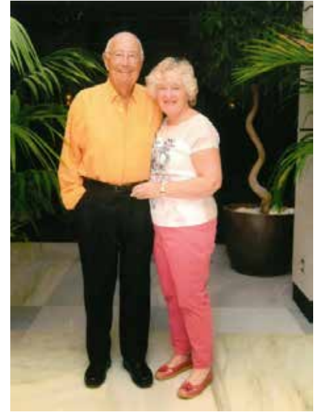
Tenerife Jan 2018