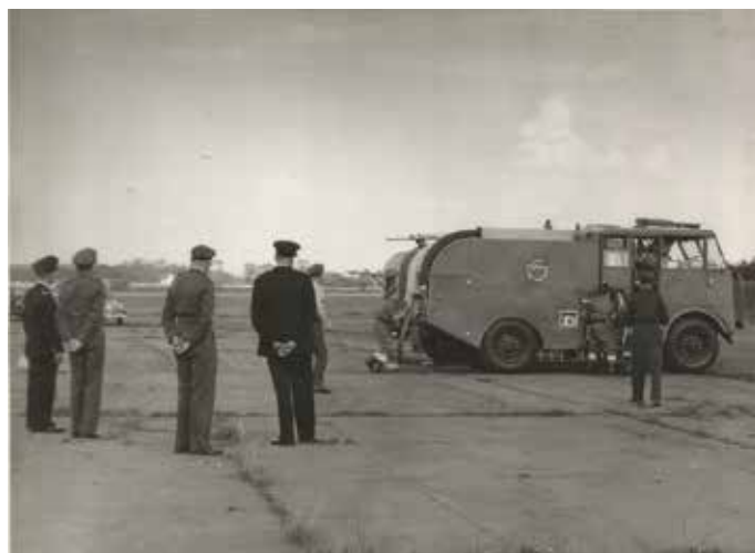
Water supply from a DP connected to MK5A