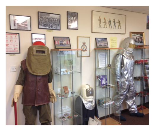
Vehicle hangar (above), RAF Room (below) Mk9, Mk8 & TACR1 (left to right)

THERE IS NO CHARGE TO ACCESS THE MUSEUM BUT WE ARE ENTIRELY DEPENDANT ON DONATIONS FOR ALL OF OUR WORK TO CONTINUE