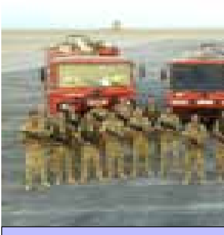
ABOVE - RAF FIREFIGHTING AND RES

In all the fire-fighters are carrying out a major assignment and showing the Royal Air Force in a fine light. A huge pat on the back must be given to the young men that are completely dedicated to a mammoth undertaking.