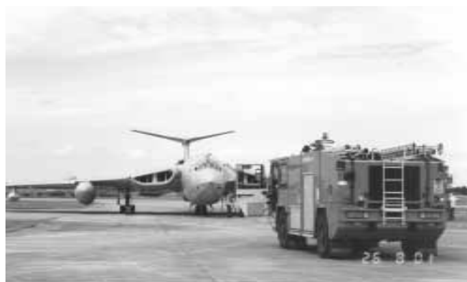
RAF Linton-on-Ouse Defence Fire Services (DFS) Alvis Rapid Intervention Vehicle (RIV) and Victor Wheel Brake incident at Elvington Airshow 26 August 2001