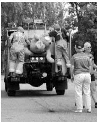
Photographic evidence of the alleged kidnappers as they made their getaway with Macmillan the Moose on a 'speedy Green Goddess!' - Ed.