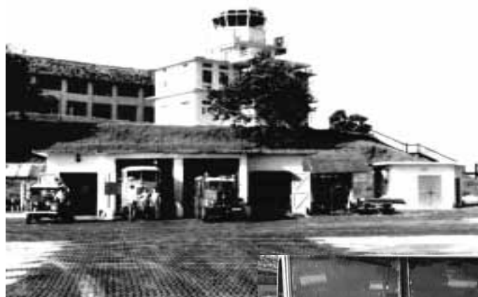
RAF Changi Crash Rescue Bays, circa 1958.