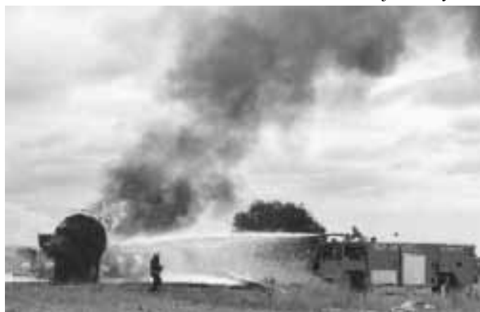
RAF Coningsby fireground demo using Training Module and Liquefied Petroleum Gas (LPG) on a simulated aircraft crash rescue exercise using light water foam via the monitor on the Alvis Rapid Intervention Vehicle (RIV) - Sunday 25 June 2000.

Like the Defence Fire Services, (DFS), reviews are ongoing and the future role of the RAF Fire Service is unsure. Hopefully it will remain a viable force in the long term. - Ed