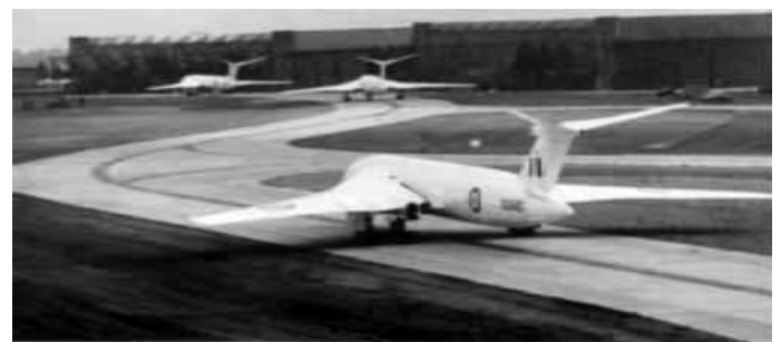
Victor V Bombers taxiing Cottesmore

the British Army which, given the fact that most of the real estate had by then been handed over to Singapore, was of little use. I had an RNZAF WO with me, and 50 locally employed, firemen, some of whom had been working for the Brits for many' years. Tengah, Seletar, and Changi were by then run by