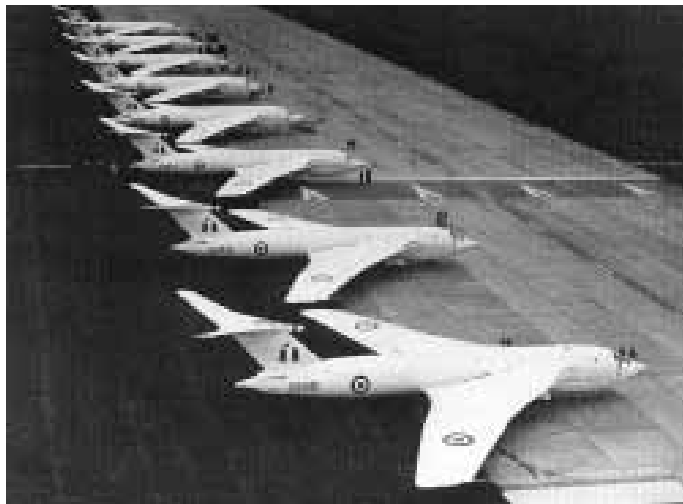
Victor line-up Cottesmore

We all returned to NZ in 1976, with me attending the RNZAF Staff College, to qualify for further promotion. I remained undiscovered long enough to pass, and gain promotion to Sqn. Ldr. I was now the Boss, and could get stuck in to another vehicle replacement, the major Crash/Foam vehicle. I had to write a specification, get it approved by the money-lenders in Treasury, then monitor the contract once it was let. That did not happen at the same speed as it takes to read this, let me tell you. Those vehicles were built on a Unipower chassis, powered by a 450 Hp turbo diesel by Detroit, with permanent four wheel drive, and the ability to produce foam on the move. They have now been in service almost twenty years, so I think I got most of it right. A young fireman I met driving one at an airshow recently told me (and he didn't