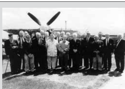
Photo of inauguration of the Royal Air Force and Defence Fire Services Association on the 13th. May 1995 at Shoreham Airport, East Sussex. Only 21 members were recorded on the photograph, and included:-

Associate Membership is open to ex and serving personnel having a minimum of three months service with the Civilian Aviation Authority (CAA) Licenced Aerodrome Fire Services.