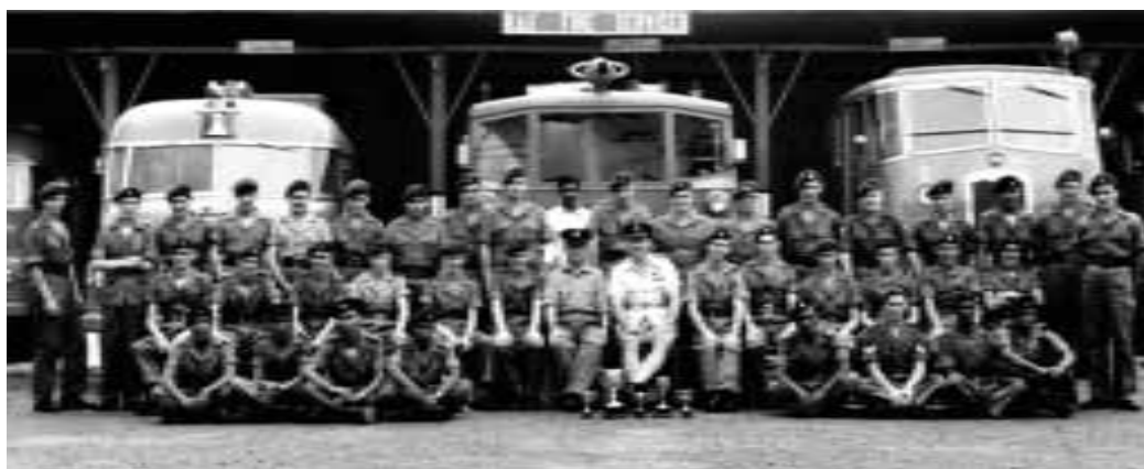
41 names listed of Fire Section Personnel RAF Changi circa 1959