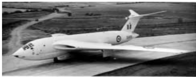
Victor taxiing Cottesmore

I left the RAF in November 1962, and was a member of the RNZAF in December, though acting, unpaid, until I arrived in NZ. All of the team that processed me in London were ex-RAF! In January 1963. I went back to London, then we were bussed to RAF Mildenhall to Join an RNZAF DC6 for New Zealand. There were some very noticeable differences between RAF/RNZAF procedures! The man who helped me locate my bag into an overhead locker I later learned was the Captain! This particular aircraft had been inherited from Air New Zealand when the airline bought Electras, so was not a military type. It had real seats, not at all like those in a Hastings or even the Britannia. It was however, short on legs which meant relatively short trips and a long way round to NZ. We left Mildenhall for our first overnight stop which was the USAF Base on the Azores. It was obvious the next day that some had been tempted by the cheap Port, (four pence a glass!) and they managed to sleep right through the next leg which was to another USAF Base in South Carolina. We had a day and a night in Charleston before we set off again, across the US, to Oklahoma and a refuel at another USAF Base, then on to San Francisco. It was on this leg that the first indications of lack of range of the DC6 began to show. We were heading for Travis Air Force Base, near San Francisco, but due to headwinds, had to