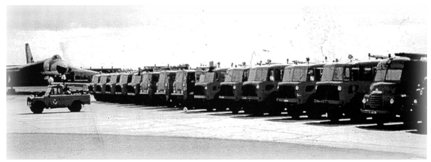
This is Smokey's own photograph of the Crash Trucks at Scampton with a Vulcan in the background

Then after 11 months there, in Sept 1969 I was promoted to Warrant Officer and posted to RAF Scampton, where we had three Vulcan Squadrons 617, 83, 27, and the Vulcan Conversion Unit. The fire section was a rather large one which consisted of 4 Mk6's, 6DP2's and 2DP1's and as far as I can remember a section of 60 firemen and 4 SNCO's.