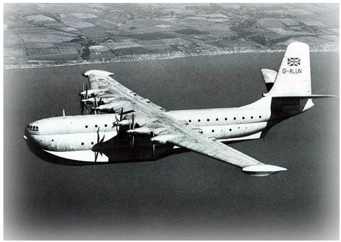
Princess Flying Boat

ferry, and probably scaring the lives out of the passengers when jets of foam shot up alongside them.