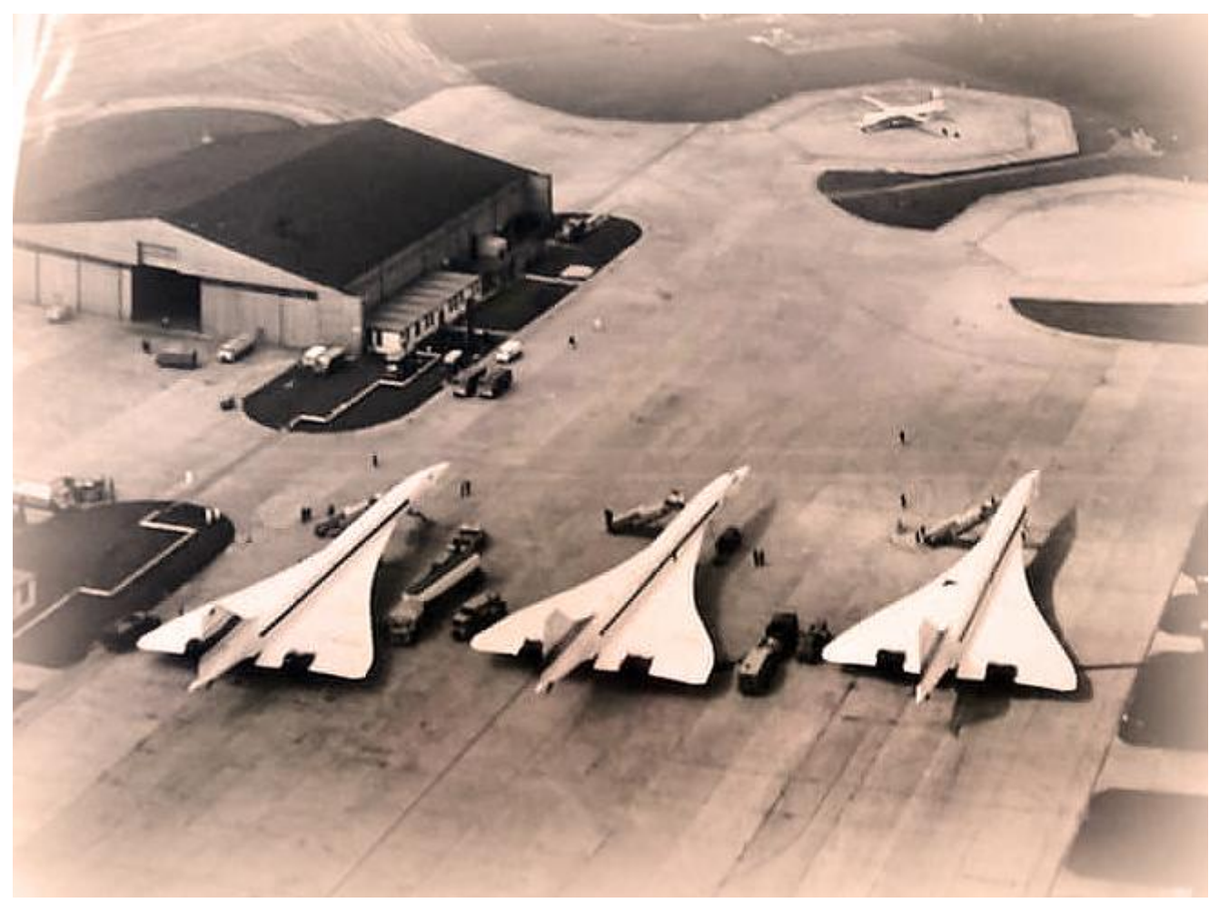
Concordes at Fairford

On another occasion we were called out to the Concorde hangar to find lots of people rushing about shouting "this" and "that" it turned out the container of the engine starting fuel was leaking on Concorde 002, which was up on jacks. The engine starting fuel was rather dangerous stuff and the hangar was reeking of the fumes, so the only thing to do was to open the doors at both ends and let the breeze take over. Luckily no one had attempted to move any electric switches as a spark might have meant that 002 would have 'taken off' without needing a runway!!