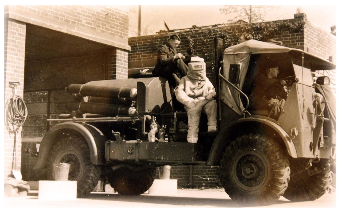
1940s Crossley Foam Tender

In those days there was no formal 'Fire Section' so fire cover was provided by a 6 man 'Fire Piquet'. This was formed by airmen being detailed from the various sections on the station. They received about 4 hours training from a SNCO who had been on a short fire course which I believe was at RAF Cranwell. The Fire Piquet manned a Crossley FWD crash truck which held 300 gallons of water, and 25 gallons of a foam compound called 'Saponine'. This consisted of pure liquid soap which was lovely for washing shirts and sheets etc.