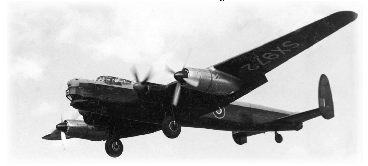
Avro Lincoln of the RAF

Another unusual incident was when a Lincoln tipped its wing against a concrete block house and ended up lying across the main Lincoln to Scunthorpe road. When we arrived, we were met by what seemed like hundreds of airmen bailing out of every orifice of the aircraft. It eventually turned out that the aircraft was going to an air display at RAF Leuchars and as it was a 'Grant' weekend lots of clever 'Jocks' had scrounged lifts to Scotland.