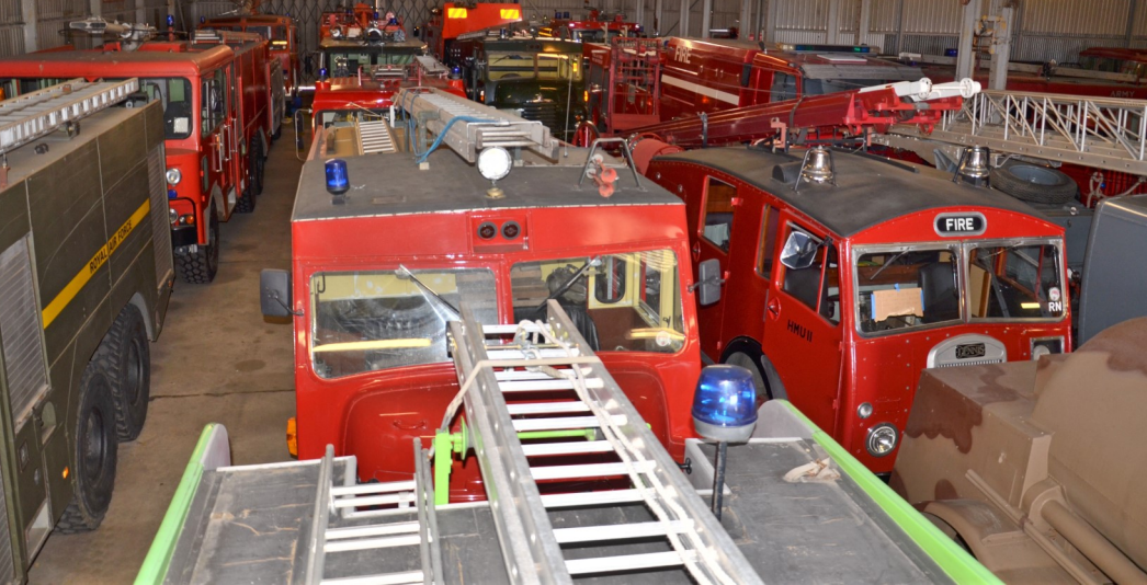
Vehicle hangar (above), RAF Room (below) Mk9, Mk8 & TACR1 (left to right)

Visitors to the Museum will be able to have a guided tour or simply browse at their own pace. The Museum is split into two parts; The Annex and The Vehicle Hangar. The Annex contains the Memorabilia, photos, badges, extinguishers, hundreds of Helmets, Caps, Models, uniforms and pictures not only from the RAF, but also from Civilian fire brigades and services from all around the world and much more. The Vehicle Hangar houses 40+ Fire Engines dating as far back as 1943 and as modern as the 1990's. There is an on-going program of restoration and visitors may see volunteers working on projects when they visit either building. There is something of interest for all ages.