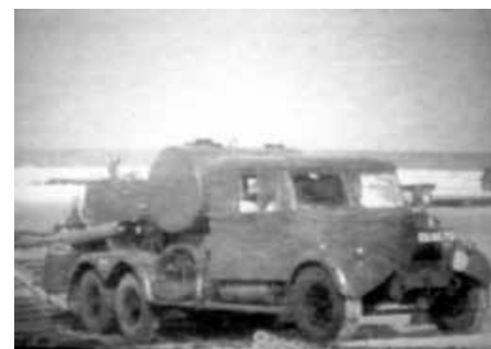
1945 Monitor 02 AG 70 driving off landing stage on Christmas Island for 'Operation Grapple' Atom Bomb tests during 1950's taken from tv picture.