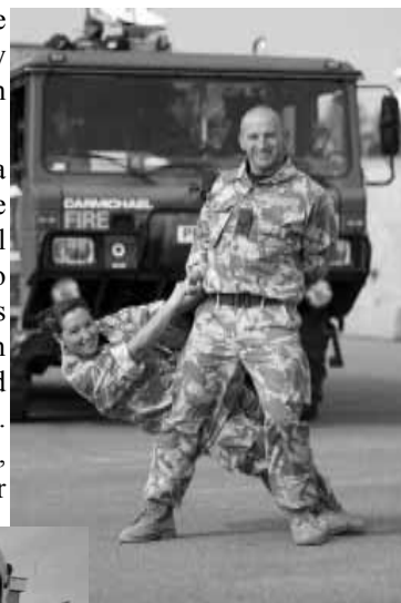
promote the Latin scene on the island.