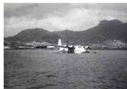
SHORT SUNDERLAND FLYING BOAT MOORED IN HONG KONG BAY

On the two occasions when RAF Venoms crashed, both on take off, once it had been established that there would probably be no fire, we were left to standby and to flush away any spilled fuel. Our one big incident was a large fire in the Chinese settlement area, across the road opposite the camp, which we tackled for a good half hour before the Kowloon fire brigade arrived, for which we got letters of thanks from the governor of Hong Kong and the British Colonial Secretary.