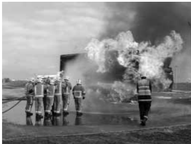
and shows one of the Fireground Simulators at Teeside Fire Training School.