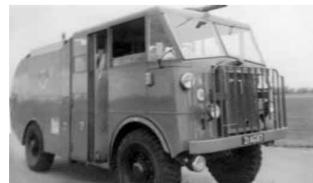
MK5A 21 AG 87 & Cab interior below