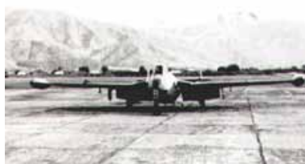
DE HAVILLAND VENOM