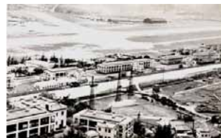
THE RAF BUILDINGS AT KAI TAK