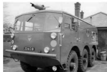
1958 Alvis Pyrene MK 6 23 AG 81 'Bruntingthorpe' 6? More next issue!