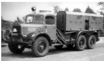
1957 Austin CO2 Gas Truck 08 AC 57