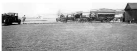
General view of crash line RAF Hendon 1956. The Belfast hangars in the background are now incorporated into the RAF museum buildings. Fordson WOT1 00 AG 08. Fordson 1945 Monitor 02 AG 73. Austin CO2 Gas Truck 08 AC 57. Landrover rescue vehicle 23 AA 81. Also on strength, was an Austin Domestic Tender, Coventry Climax trailer Pump and Bedford 500 gallon Water Tender.