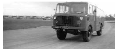
DP1 24 AG 37 & Blackburn Beverley