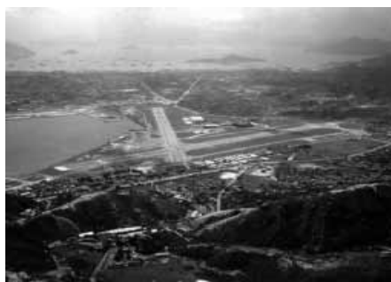
AERIAL VIEW OF KAI TAK AIRPORT

Please find enclosed the pictures taken at RAF Station Kai Tak circa 1957, as promised several months ago. As you can see on the group photograph we were a pretty immature lot, in fact us six LAC's were on our first posting, straight out of training school, Sutton-on-Hull, so it was a good job that we were only back-up for the Kai Tak airport's fire section, who were Chinese firemen with European Officers.